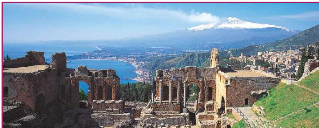
Taormina with Mount Etna in the background

We have a guided coach excursion to Taormina and Mount Etna today. The beautiful town of Taormina is one of Sicily's most famous resorts. Perched on a rocky promontory overlooking the sea with dramatic views of Mount Etna it certainly justifies its nickname 'the Pearl of the Mediterranean'. From Taormina we drive through Mount Etna's national park to reach the highest point for public vehicles where we take lunch in a mountain trattoria. Etna is one of the most active volcanos in the world and it was the legendary home of the Roman fire god, Vulcan, and the mythological one-eyed Cyclops. This afternoon there will be time to take a walk on the lava.