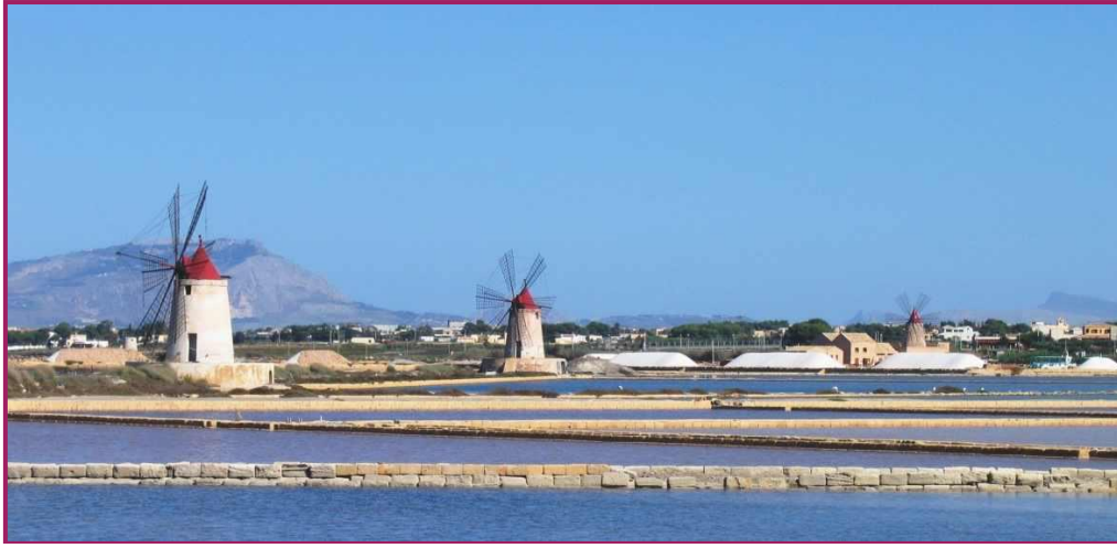
'North African Coast'